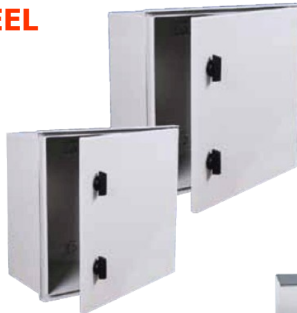
PSKS RANGE POLYESTER 7 MODELS