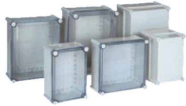
PSPK RANGE POLYCARBONATE 80 MODELS