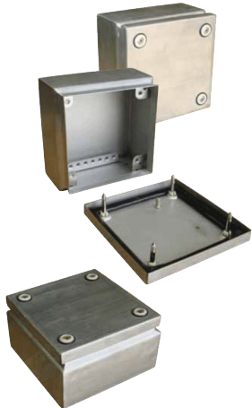
PSKLS RANGE STAINLESS STEEL 18 MODELS