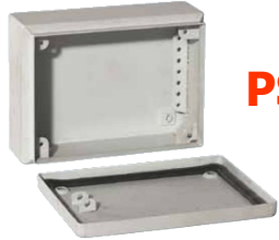
PSKLM RANGE MILD STEEL 19 MODELS