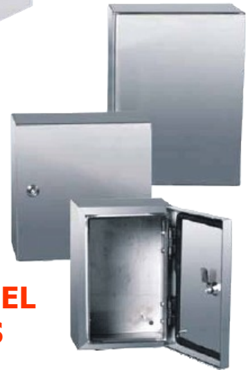
PSSS RANGE STAINLESS STEEL 19 MODELS