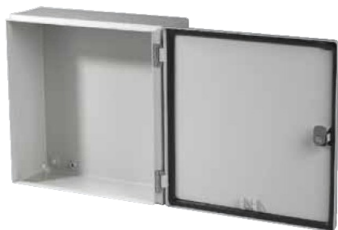
PSTB RANGE MILD STEEL 16 MODELS