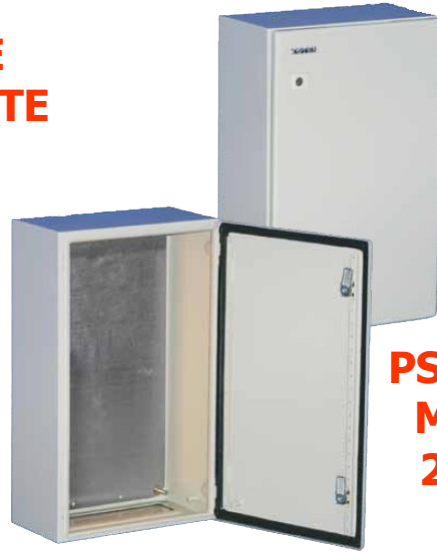
PSCE RANGE MILD STEEL 27 MODELS