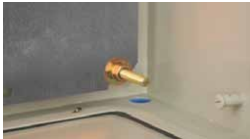
Adjustable mounting plate