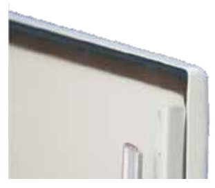
Formed in PU Seal