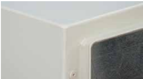
Multi - Folded Protection